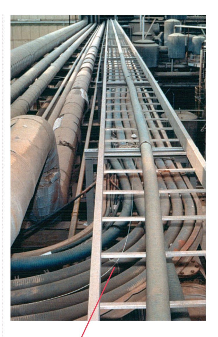
Protectowire Linear Heat Detector

Protectowire Linear Heat Detector is a component of a complete family of fire detection systems manufactured by The Protectowire Company.