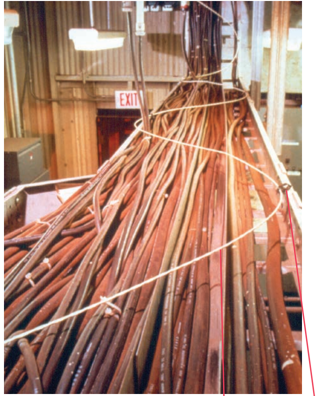
Photo taken at: Bethlehem Steel Corp. Sparrows Point Plant, Sparrows Point, Maryland, U.S.A.