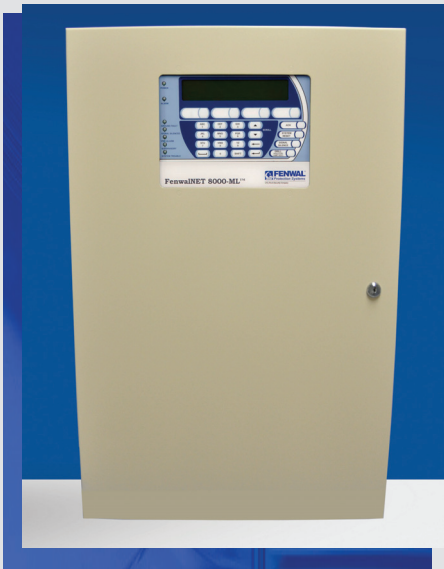
FenwalNET 2000-8000-ML Control Unit Retrofit Kit. Available with red door for New York City Installations.

The FenwalNET 8000-ML is the latest addition to a proud legacy of Fenwal suppression-system control units. One of the most advanced intelligent, fire alarm-suppression-focused control units available to the industry today, the FenwalNET 8000-ML is the natural choice for controlling your suppression system – new or installed.