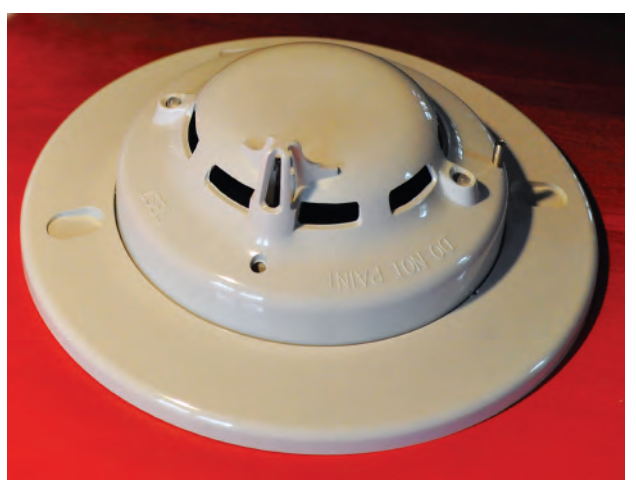
SLR-24H Combination Detector