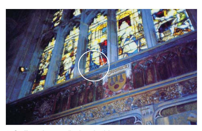
2 Capillary tube protruding in to the risk