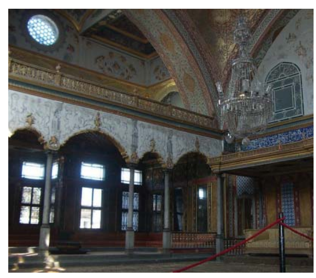
4 Topkapi Palace, Turkey protected by VESDA using concealed capillary sampling tubes

3 Pipework can be routed, via capillary tubes, to a convenient location within the risk area, using the building fabric to hide the sample points