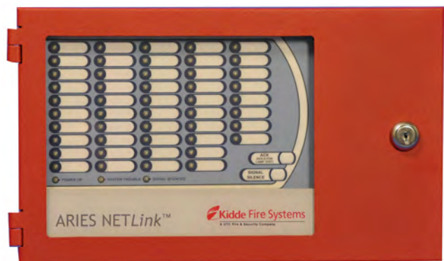
Figure 5. R-LAM

R-LAMs are annunciators that provide 48 independently programmable LEDs. Each LED is dual color (red and yellow) and has space available for an identification label. R-LAMs include three system-level LED outputs for Module Power, System Trouble and Signal Silenced. Also included are system-level input functional switches for Signal Silence and System Acknowledge/Self-Test commands. R-LAMs are mounted remotely from the main enclosure and utilize the same remote enclosures as do RDCMs. LED Annunciator Modules can also be mounted within the main ARIES NETLink enclosure for ULC/cUL applications.