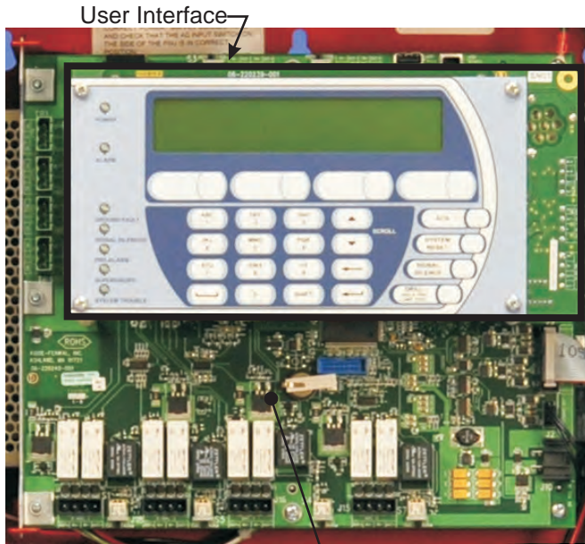
Figure 2. Main Controller Board and User Interface