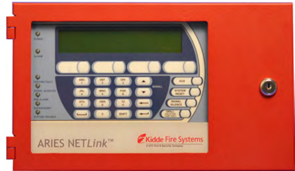
Figure 4. RDCM

RDCMs are user interfaces that replicate the ARIES NETLink and can be located remotely from the main enclosure so as to accomplish system control from multiple locations. RDCMs display all system events and allow full system control and operator intervention via an LCD display, keypad, buzzer, five (5) system status LEDs and four (4) user-programmable soft-keys. A synchronization signal output allows expansion of up to 15 RDCM units. RDCMs are wall mountable in their own discrete enclosures and operate on 24 VDC sourced from either the ARIES NETLink Auxiliary Power Output or listed external power supply.