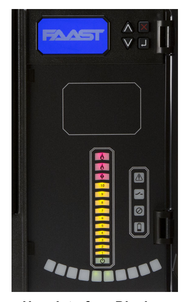
User Interface Display: Intelligent FAAST® XS

P-COUPLING: Coupling. P-ELB-45: 45° CPVC Elbow. P-ELB-90: 90° CPVC Elbow. P-PIPE-210: CPVC Pipe.