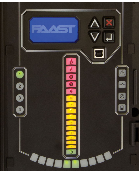
User Interface Display: Intelligent FAAST<sup>®</sup> XT and Intelligent FAAST<sup>®</sup> XT PRO